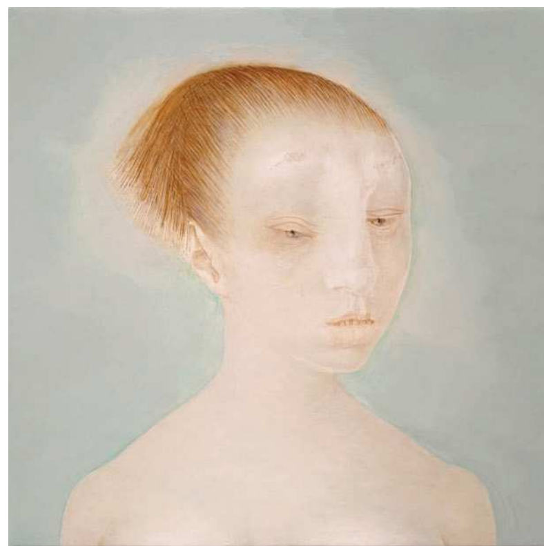
Portrait (Pigtails), 2019, oil on panel, 12 x 12"