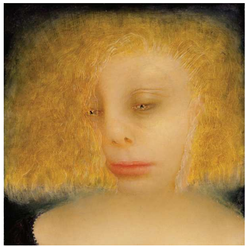
Portrait, 2019, oil on panel, 12 x 12"