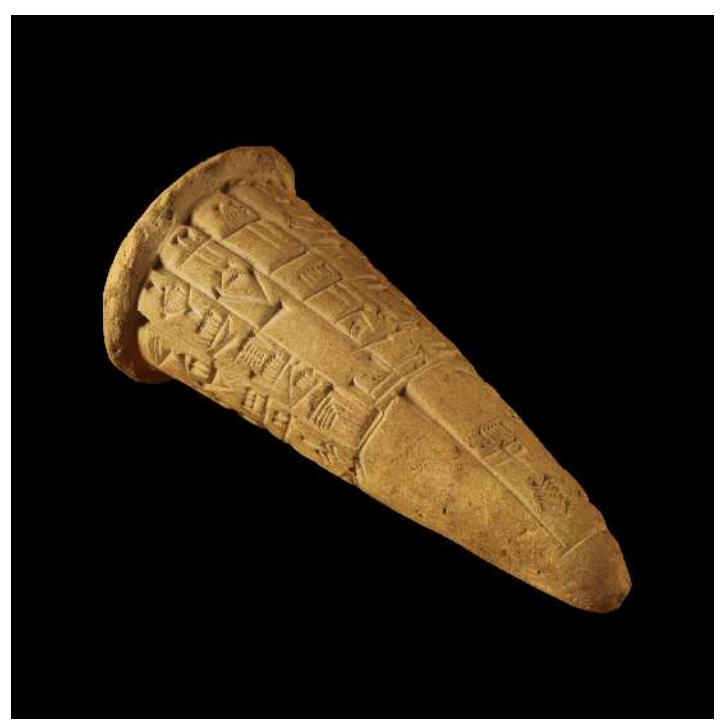
Foundation Peg of Gudea, King of Lagash.

The clay cone tradition lasted only for a few centuries. By the third millennium, however, very similarly shaped "pegs" were being used to attach the growing power of these temples, by this point stretching back to time immemorial, to the identities of particular kings who sponsored their various episodes of rebuilding. Each time a temple was rebuilt, the construction team looked for the original foundations of the temple and unearthed a deposit that contained a collection pegs inscribed by every king whose labor teams had engaged in the same activity of renovation since the practice began. A new peg naming the current king was added, and the collection of objects was reburied. It was based on these deposits that the king Nabonidus (r. 559-539 BCE) wrote some of the earliest known histories based on archaeological data, and assembled his archaeological museum, the earliest known building for this purpose. These histories were histories of those temples, those places, that had, through millennia of experience, oral and written history, and objects of beautification, become the cornerstone of the "cuneiform culture" that reached its greatest geographical extent under Nabonidus.