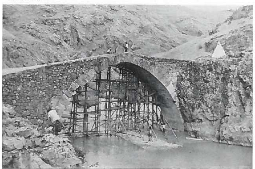
Köprünün mansap tarafı görünüşü View of the upstream side of the bridge

1 Söküm iskelesi kurulmuş, kemer sırtı temizlenmiş, taşların sökümüne geçilmek üzere The scaffolding is erected, the arch of the bridge cleared, and work is about to begin on the dismantling of the stones