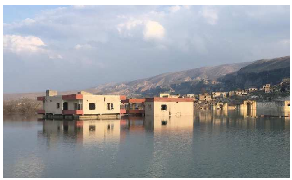
Hasankeyf in February 2020.

In this exhibition SaraNoa ties together all of these processes and attitudes with a collection of work formed from materials that take millions of years to decompose. Here, replicas of the clay cones that once marked buildings as having an eternal meaning beyond their material existence mingle with work made from industrial stone scraps that were discarded as worthless as soon as they were created. Here, monuments that were forgotten, discarded, buried, and submerged gain new life in the human consciousness.