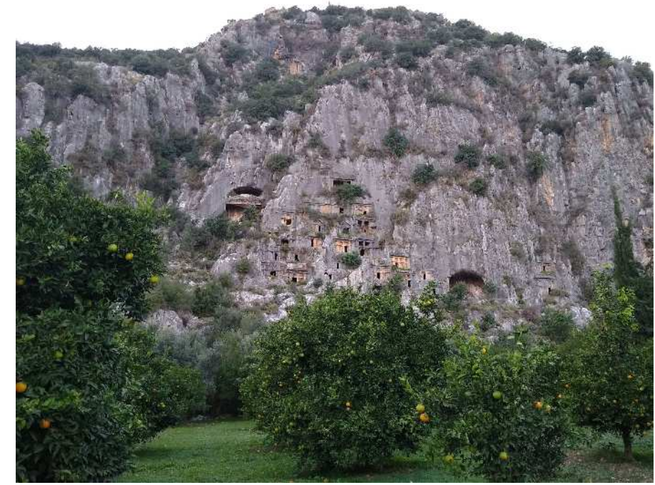
Myra tombs in an orange grove.

The passage of time and the events of history have a way of transforming places and buildings from monuments with unavoidable power to refuse or raw material and back. Last year, SaraNoa traveled through Turkey as a part of a Fulbrightsponsored project to physically interact with ancient and medieval rock monuments in the country. During these travels, they were touched by the mysterious ways the rock monuments were transformed through this never-ending process. How is it that one cliff face, carved into elaborate tombs by the ancient inhabitants of the city of Myra, has become a Turkish national park and an internationally recognized tourist destination, while the opposite face, carved into similarly stunning tombs, remains the backdrop of privately-owned orange groves? How is it that an equally elaborately carved Phrygian tomb near the village of Ayazini has become a stone quarry? And how did it happen that a stone quarry outside the ancient city of Ephesus made the opposite journey, first as a Roman burial site and then as a Byzantine site of pilgrimage? And finally, as they watched the waters of the newly created Ilisu Dam reservoir rise, how was it that a collection of medieval religious buildings was removed from the ancient town of Hasankeyf, and reconstructed on the cliffs above, while the similarly aged houses and market were left to be submerged?